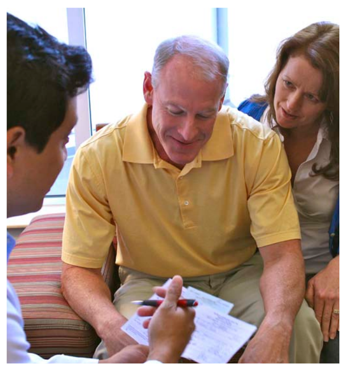
Following your doctor's advice and taking your medications as directed are important steps to managing your heart failure.

You can help by taking your medicine as your doctor tells you, and by following your eating and exercise plans.