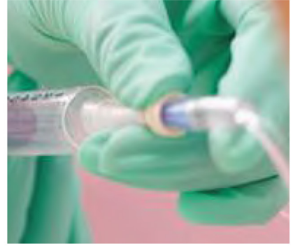
Alteplase IV r-tPA treatment